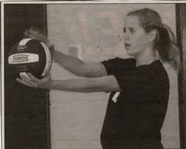
JESSE CNOCKAERT/THE CHRONICLE