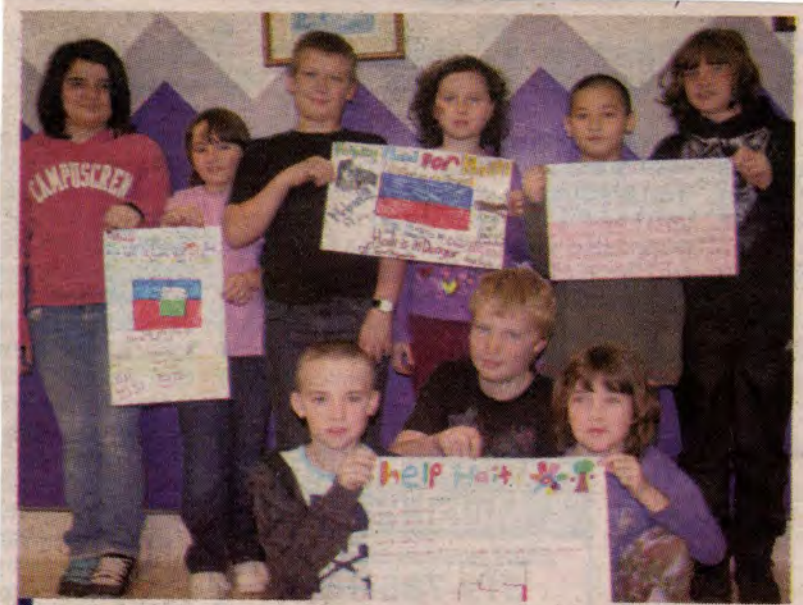
Jesse Cnockaert/The Chronicle